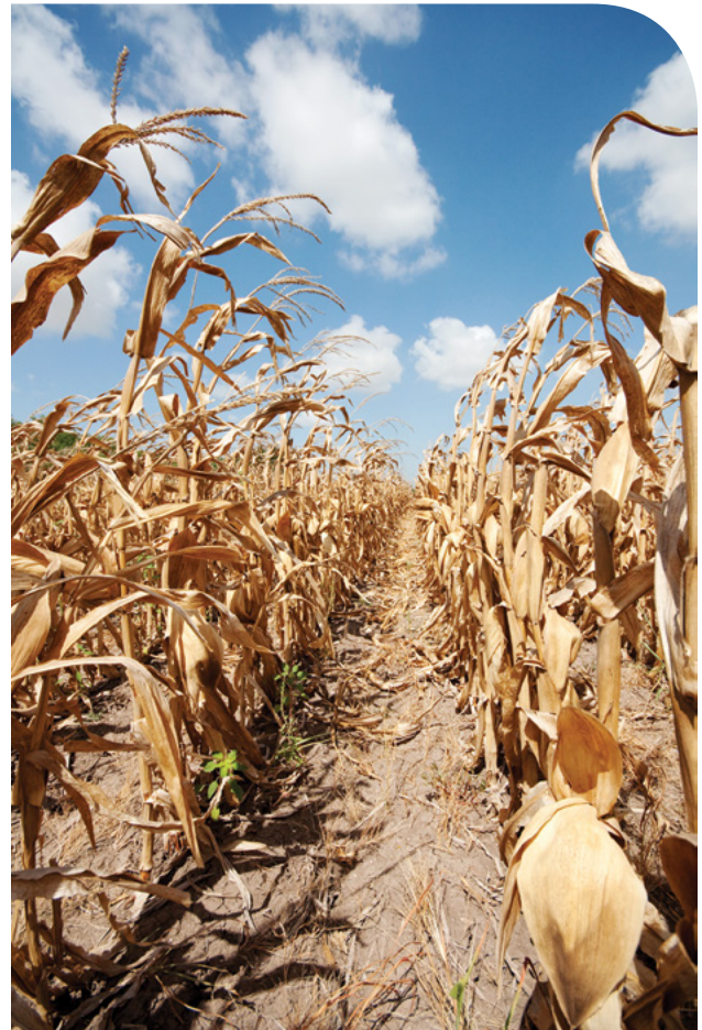
Failed corn crop due to drought in the Lower Rio Grande Valley

Wholesale public water suppliers, retail public water suppliers with 3,300 or more connections, and irrigation districts must develop drought contingency plans and submit them to the Texas Commission on Environmental Quality. Retail public water suppliers with less than 3,300 connections must develop plans and make them available upon request. Investor-owned utilities are also required to develop drought contingency plans. Wholesale and retail public water suppliers must also notify the Texas Commission on Environmental Quality within five days after implementing any mandatory drought contingency plan measures.