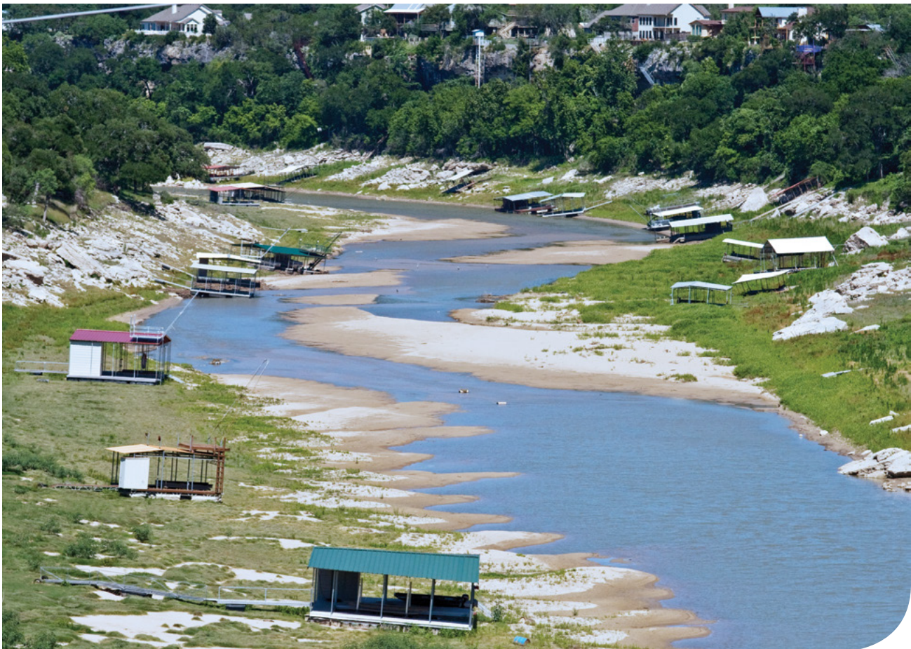
The Pedernales River more than 20 feet below normal levels, leaving the boat docks unusable

In some cases, drought management was recommended only as a near-term, stop-gap strategy to be displaced in later planning decades by projects that provide additional water supplies. Planning groups did not, in general, consider it prudent, sustainable, reliable, and/or economically feasible to adopt a regional plan that would intentionally require restrictions on normal economic and domestic activities, especially when there were feasible alternatives. The effectiveness and sustainability of drought measures varies between utilities and were sometimes not considered to be predictable or reliable enough to quantify for inclusion as a recommended water management strategy. Most planning groups chose instead to leave potential water savings from drought management measures as a back-up or last-resort response to address uncertainty, such as the event of a drought worse than the benchmark drought of record (BBC Research & Consulting, 2009).