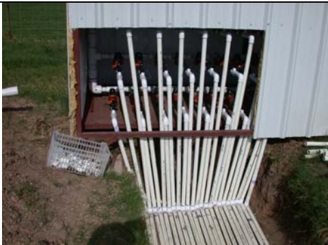
Sub-mains to water source