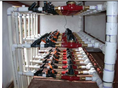
Complete valve set-up