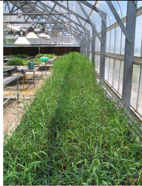
Growing Tifton 85 bermuda grass transplants