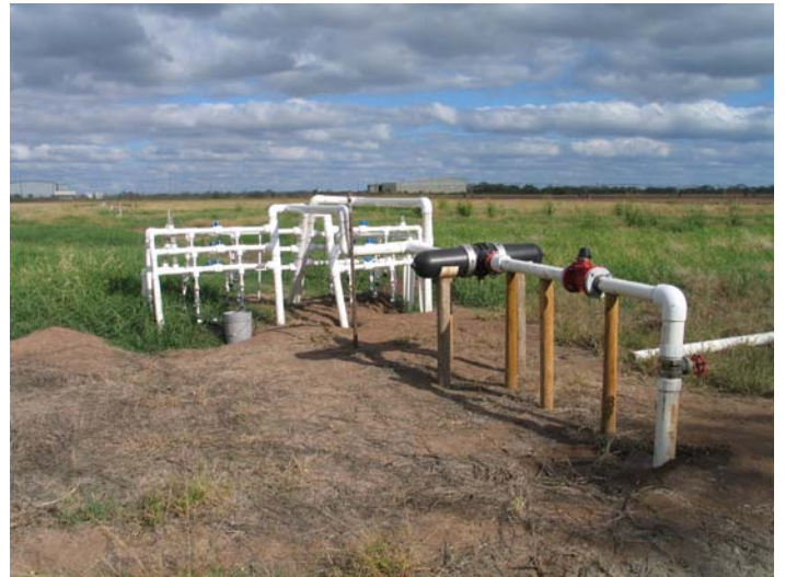
Valves for 6 acres with water meter, filter and control