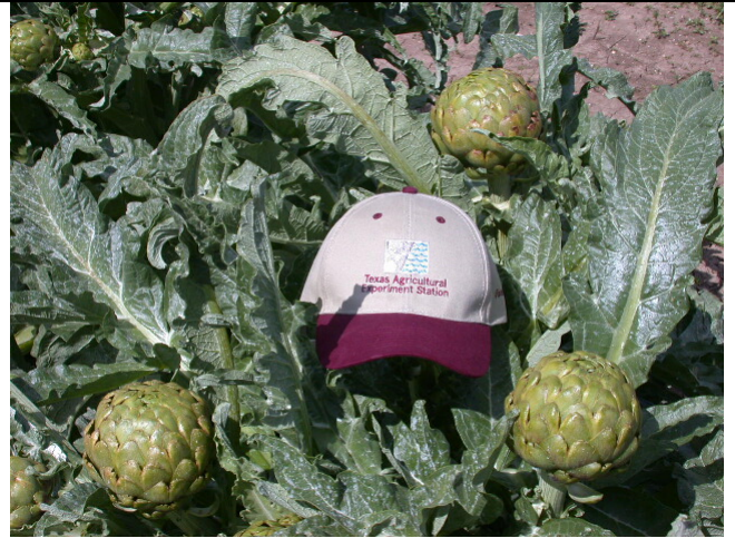
First head to harvest (under hat)