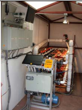
Fertjet and controller