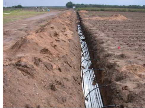
Sub-mains with drip lines