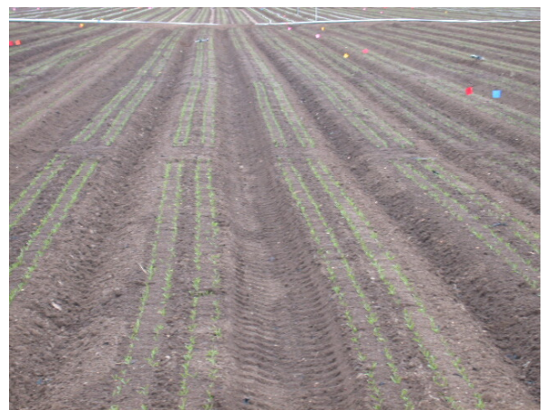
Spinach emergence with SDI