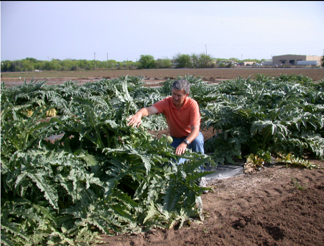
Early vegetative growth