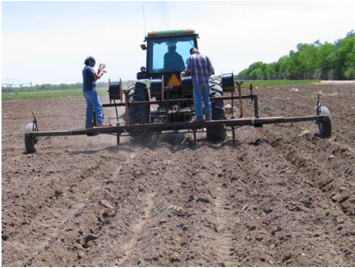
Installing drip tape