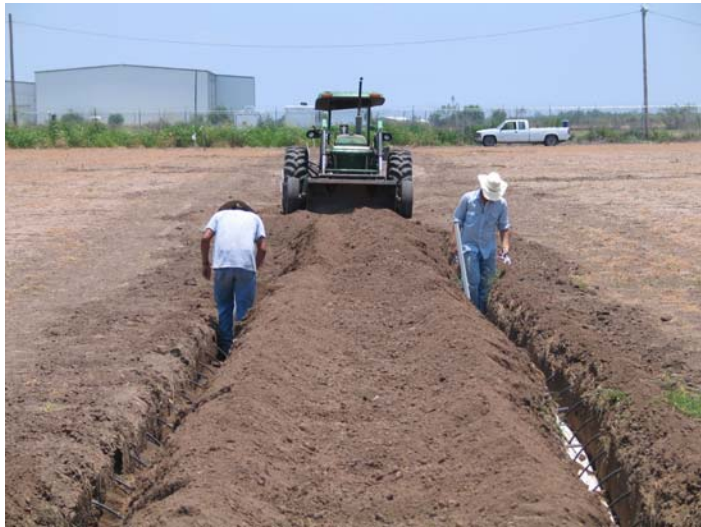
Connecting tape to headlines and back filling trench