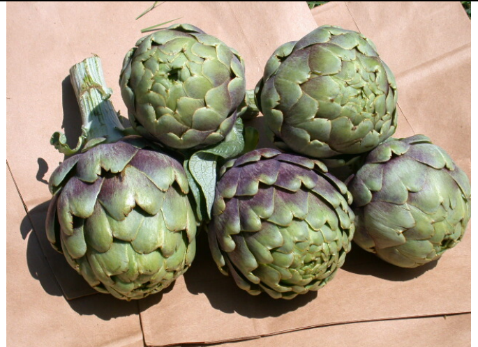
Green Globe artichoke cultivar