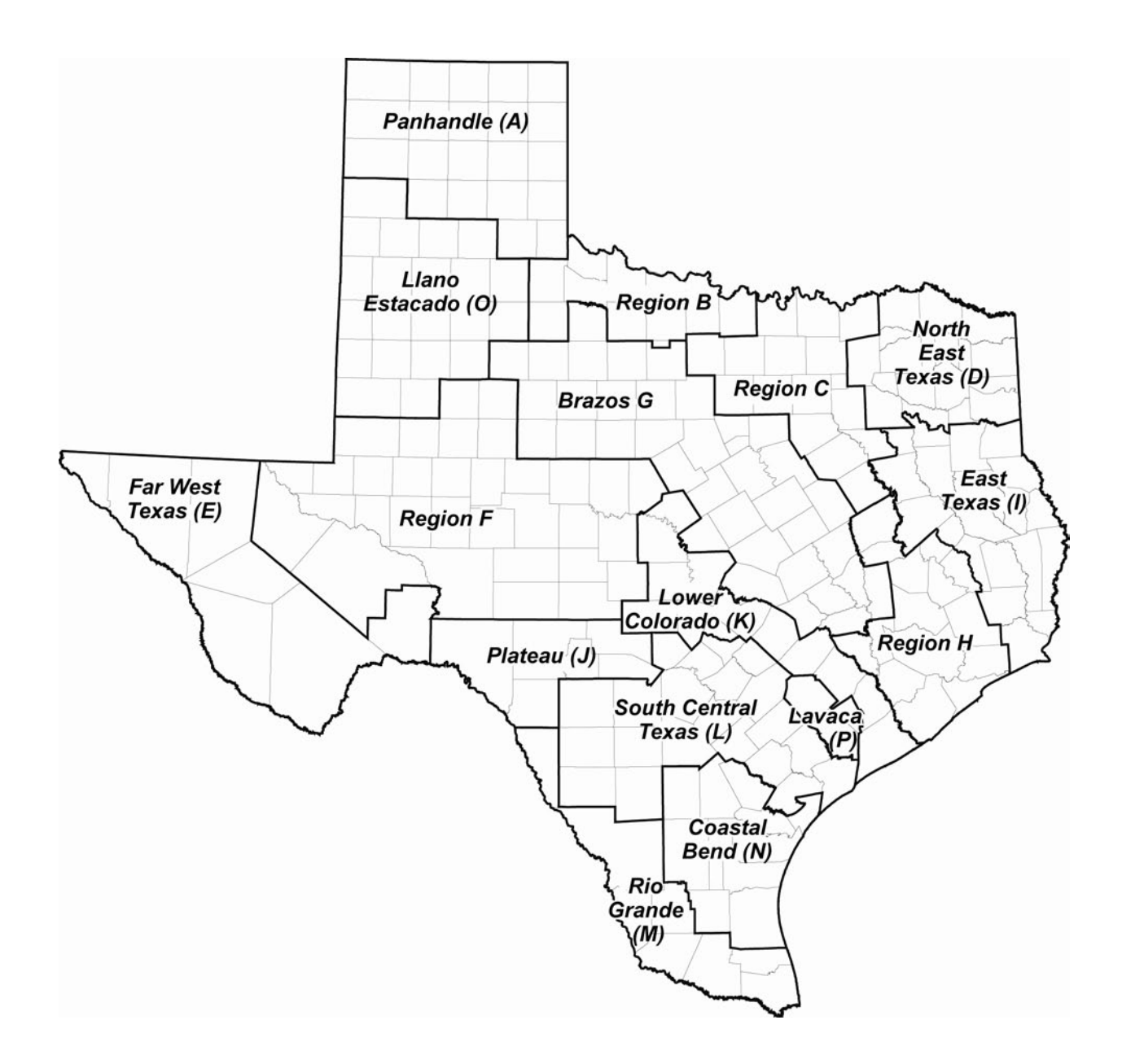
Figure 1: Map of the Regional Water Planning Areas