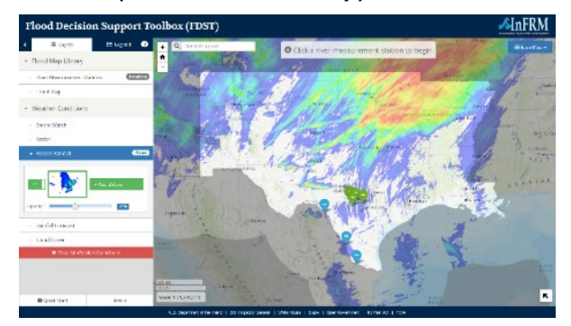
Rainfall Totals (1 hour, 1, 2, 3 days)