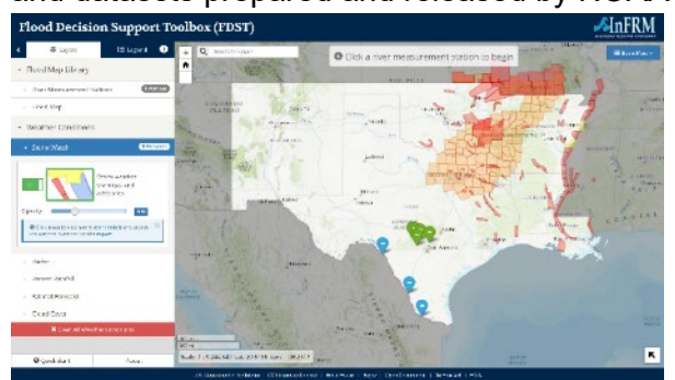
Warnings and Watch Locations

The Flood Decision Support Toolbox allows users to interact with the various weather forecast and datasets prepared and released by NOAA and the NWS, to include: