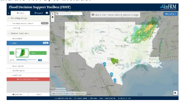
Radar (Static or 1 hour loop)